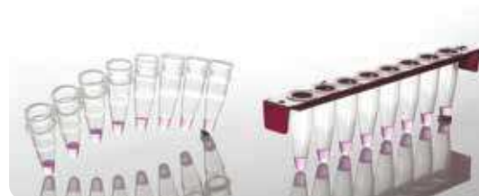
Figure 15: Unlike standard tube strips, the FrameStrip® will remain straight and stable, even at elevated temperatures and when filled with liquid.

FrameStrips® are available with either domed cap strips or flat, optically clear cap strips, and are compatible with the majority of thermal cyclers. End tabs allow for easy handling and labelling of the strips and some products are also available with an off-the-shelf 2D code, offering a vast supply of unique code combinations.