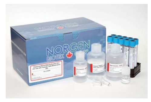
Tempus™ Blood RNA Tubes are not included with the kit

Purification is based on spin column chromatography using Norgen's proprietary resin as the separation matrix. The RNA is preferentially purified from other cellular components such as proteins. The purified RNA is of the highest integrity, and can be used in a number of downstream applications including real time PCR, reverse transcription PCR, Northern blotting, RNase protection and primer extension, and expression array assays.