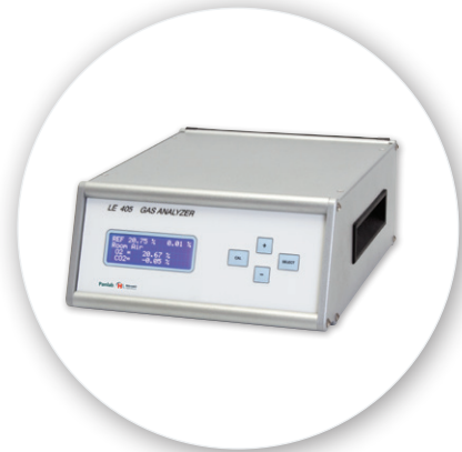
OxyletPro Gas Analyzer

For additional activity monitoring, our IR sensor bars ⑨ are added to detect occurrence and duration of rearing events.