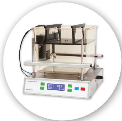
OxyletPro Rodent Home Cage & Sensor Platform