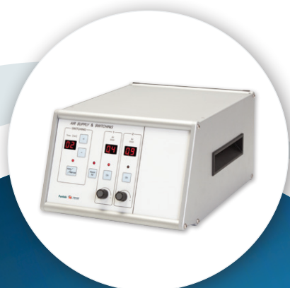
OxyletPro Air Supply & Switching Unit